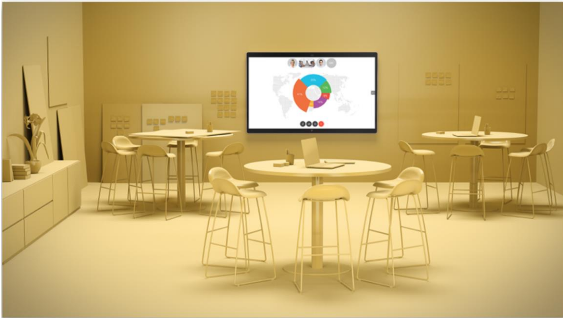
Figure 1. Cisco Webex Board 85 in a large-team environment

* The latest generation Webex Board family may be referred to as the “S Series,” representing some minor optimizations to the hardware platform. Product name remains the same but PID reflects addition of “S” to differentiate from original version for ordering purposes.